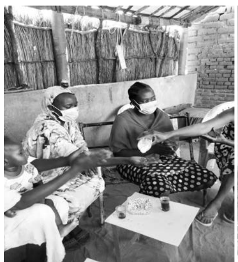
Figure 2. Women of South Kordofan

SPLM-N regulates the agricultural sector through the Directorate of Agriculture and Food Security, which works closely with NRRDO and with mixed-gender farmers' cooperatives in the area. This directorate oversees different sectors, including agricultural engineering, protection (from pests and other dangers), guidance to support farmers, and research and planning.