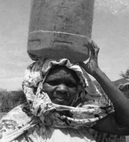
Left: FGD, Kauda, April 2021.

Right: "Rights are not given but taken." Women farmer in Kauda, April 2021.